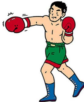
Figure 2 Boxers